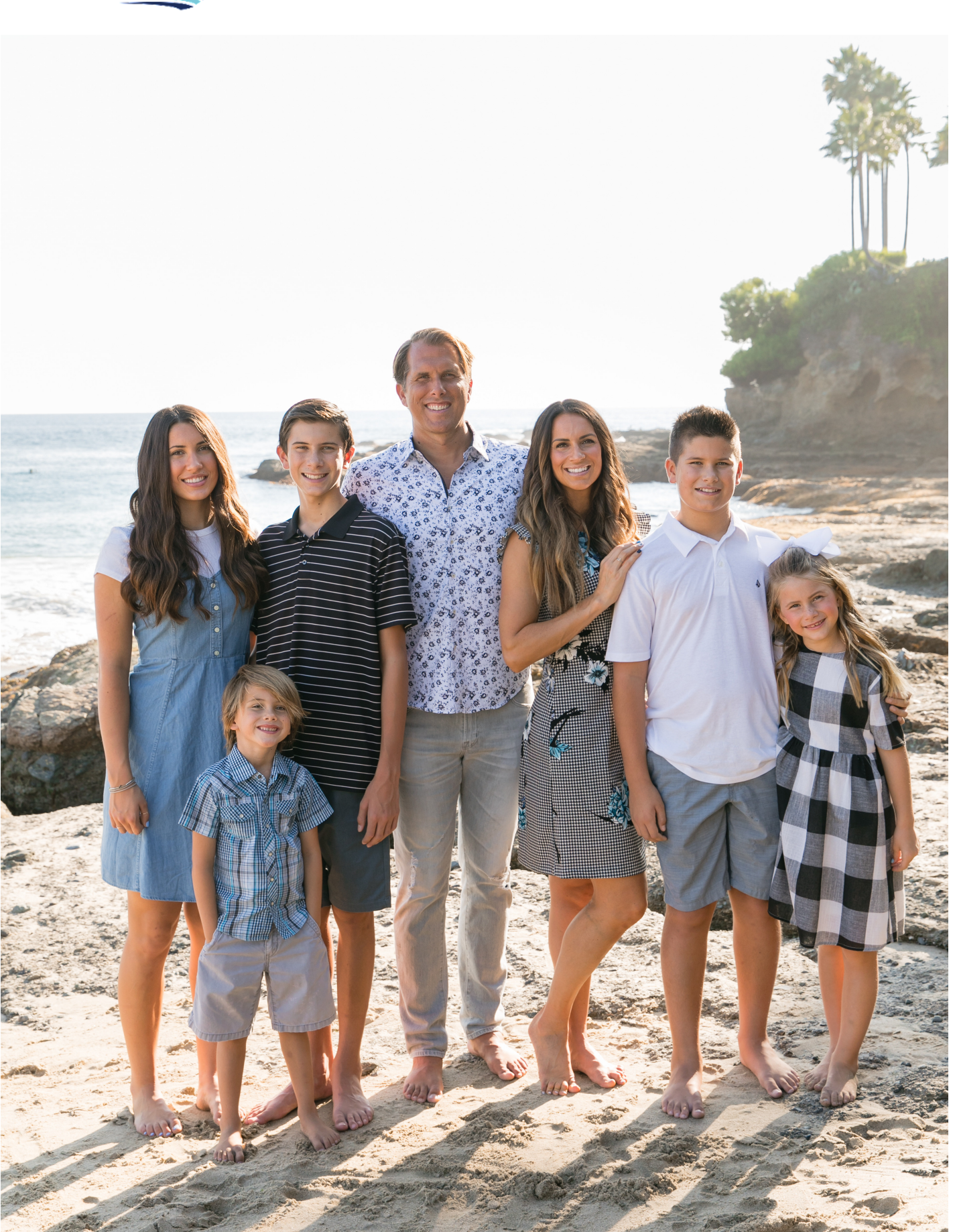
December 22, 2020

MERRY CHRISTMAS AND HAPPY HOLIDAYS, from my family and our Pacific Capital team!