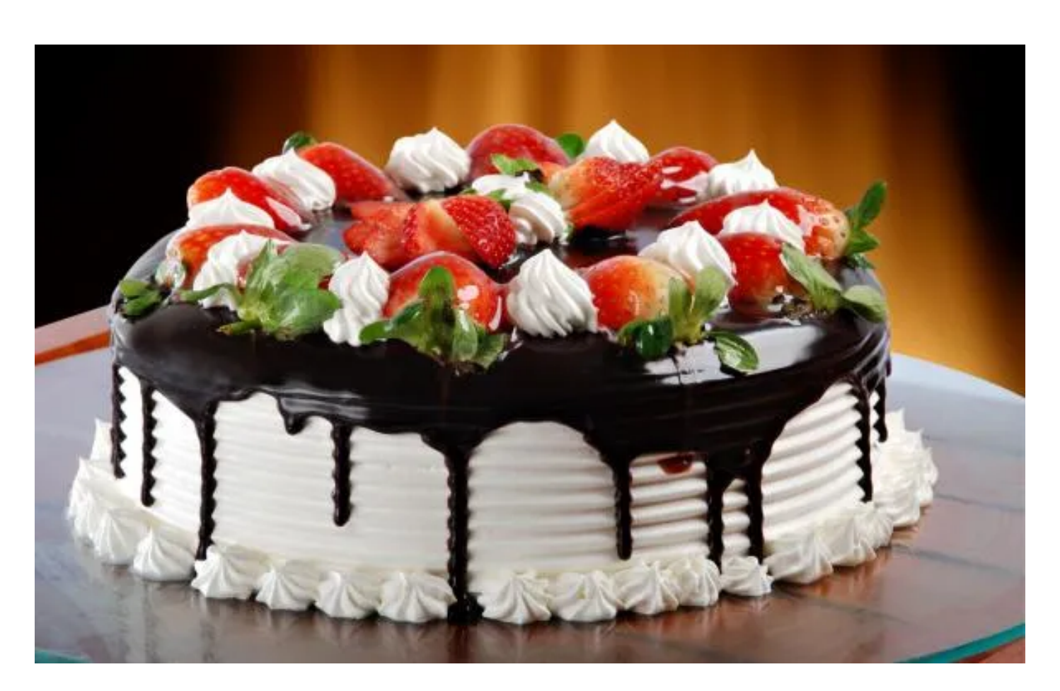
August 4, 2020

When baking the perfect cake, you not only need all the ingredients, but you need to know the right proportions of the ingredients.