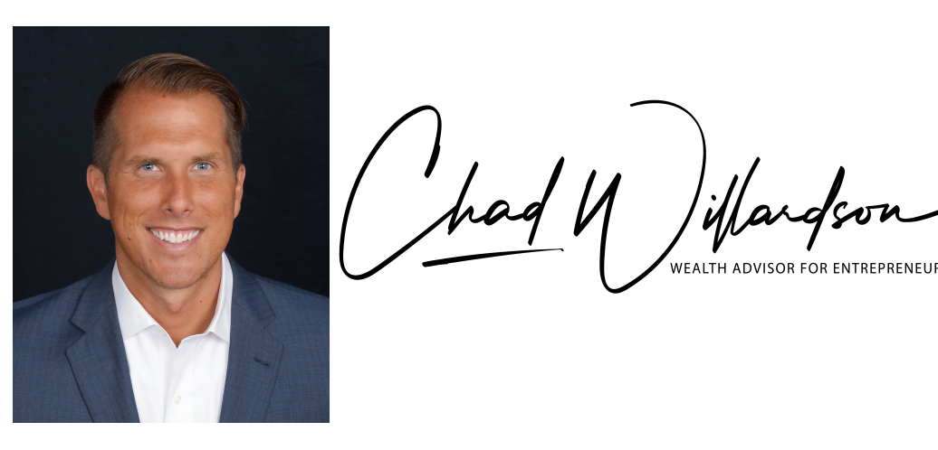
Certified Financial Fiduciary®

Click <u>HERE</u> to read our google reviews.