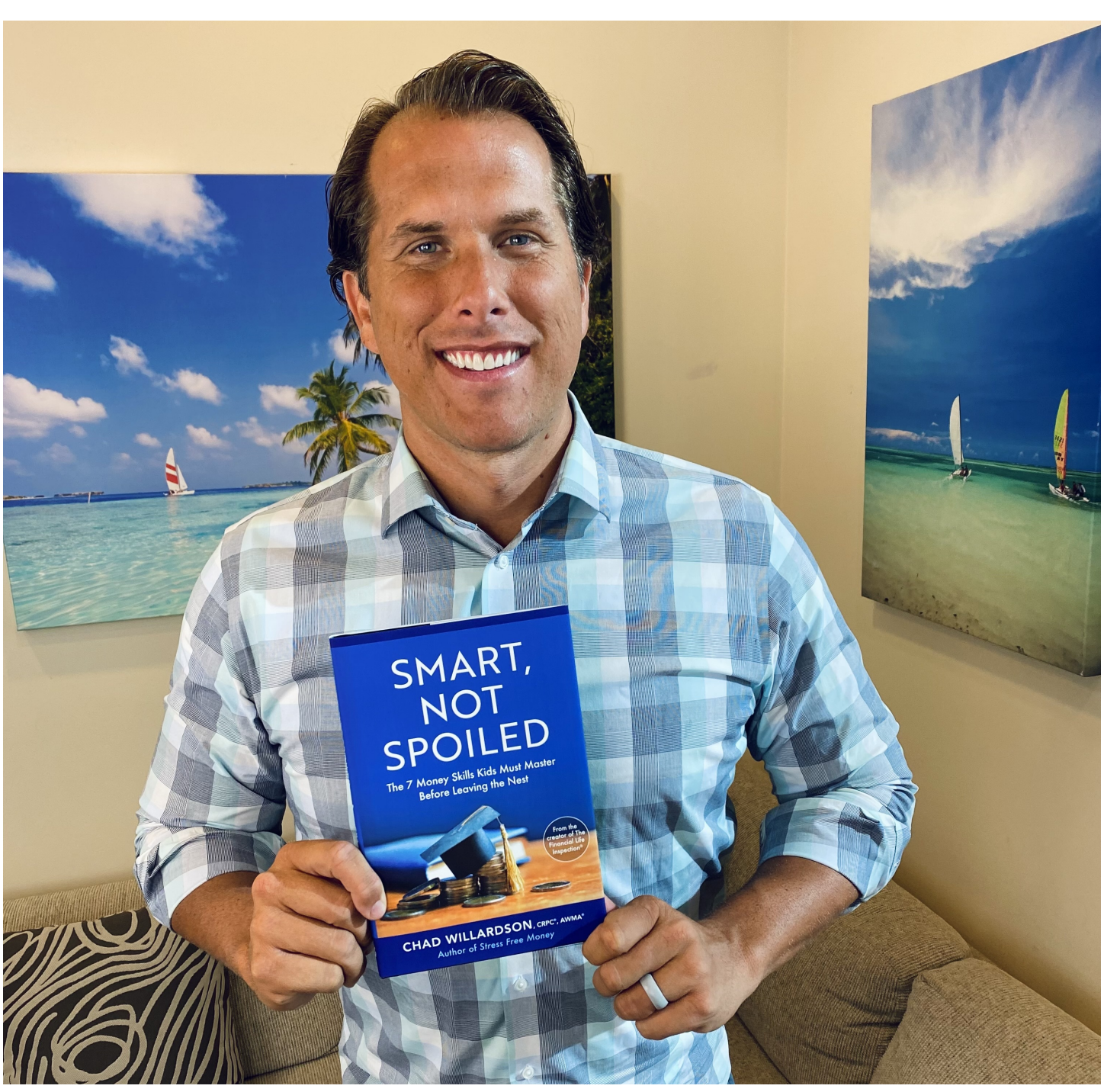
September 14, 2021