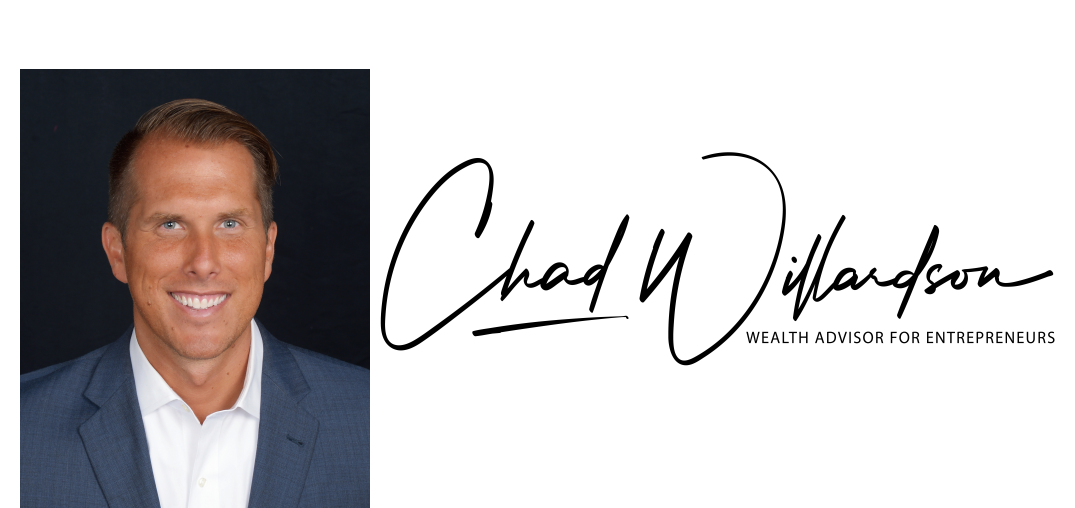
Certified Financial Fiduciary®

Click <u>HERE</u> to read our google reviews.