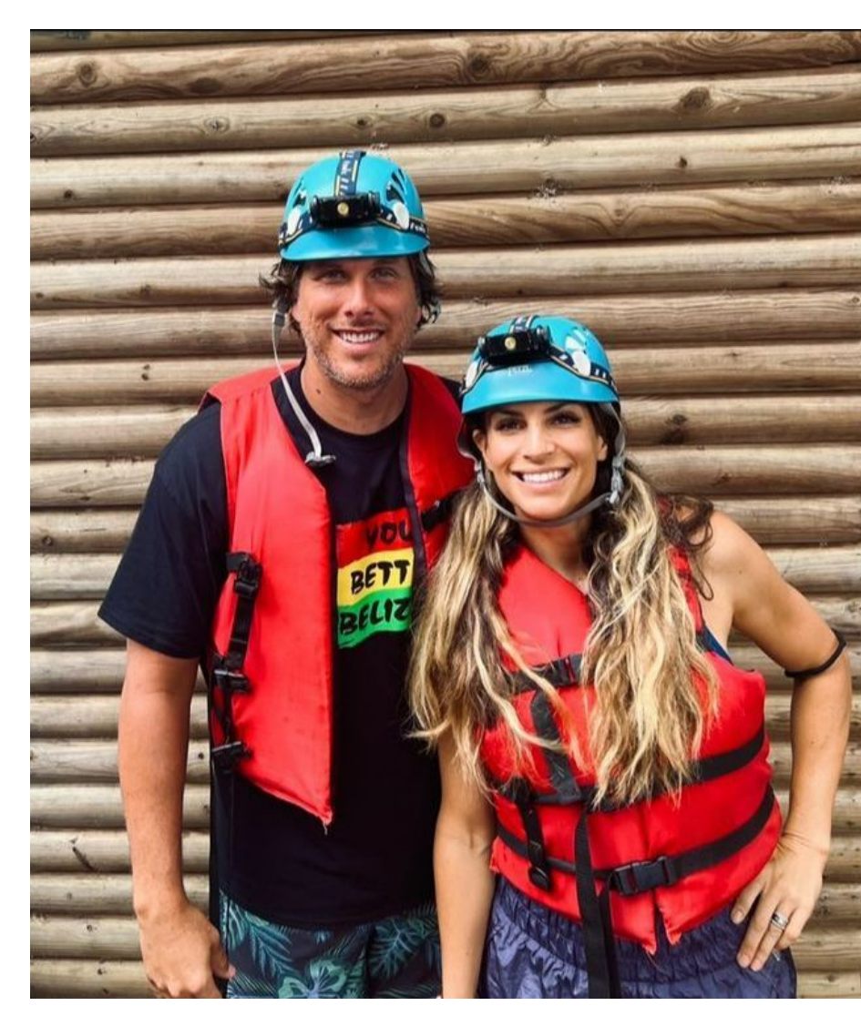
Travel Agent vs. Travel Guide